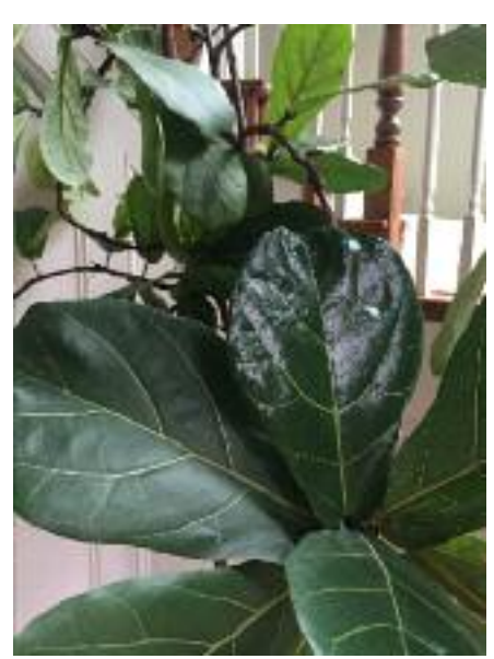
Fiddle leaf figs are great for rooms with high ceilings. Leaves are bright, shiny, green.

temperatures are between 70 and 80 degrees Fahrenheit during the day and 10 to 15 degrees lower at night, but thrive in basically the same temperatures that make humans comfortable.