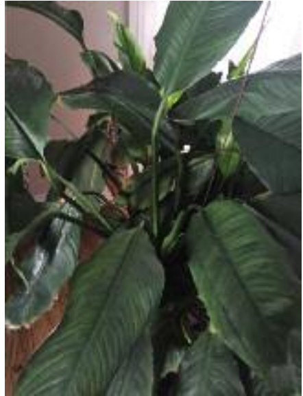
This spathiphyllum peace lily is over 25 years old!