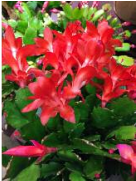
Rich red Christmas cactus thrives indoors.